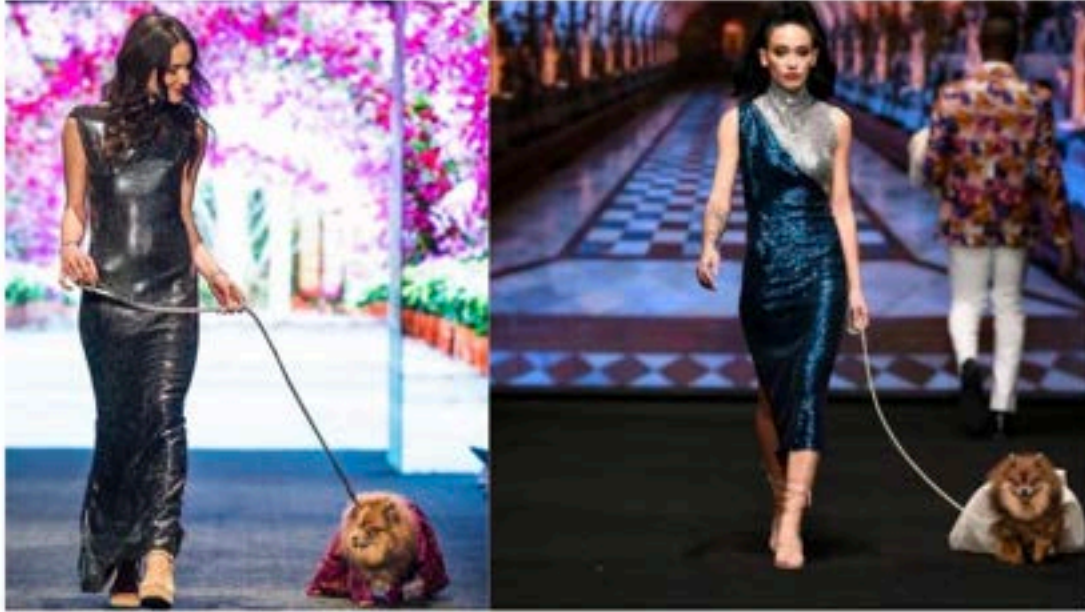
Daffodil walks the runway.