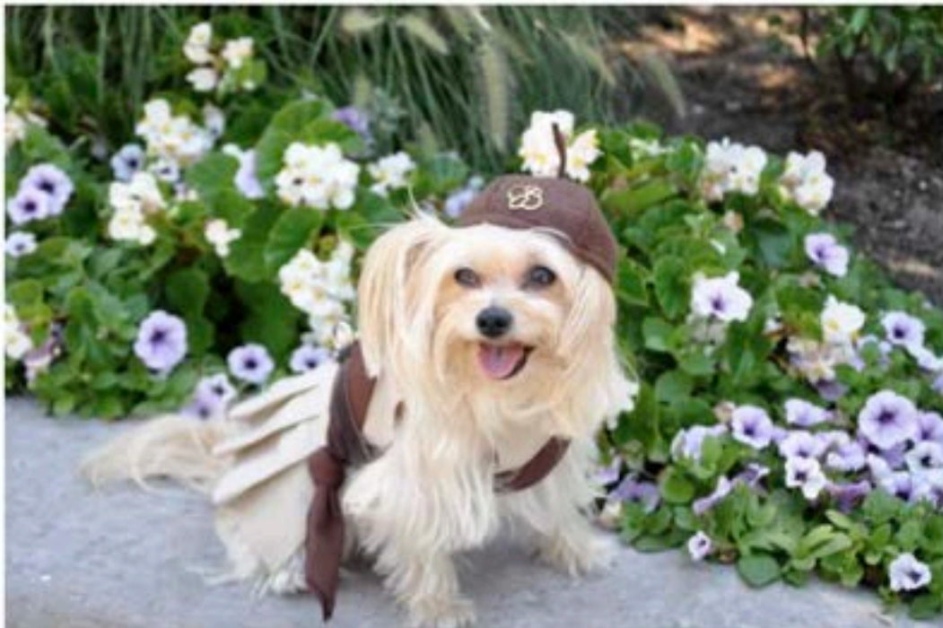
Tasha in her Pupscout uniform.